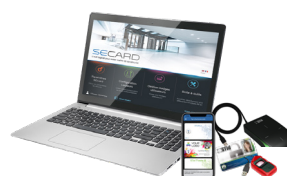
SECARD SECard configuration kit and SSCP® v1 & v2 and OSDP™ protocols

**Caution: information about the distance of communication: measured from the center of the antenna, depending on the type of credential, size of the credential, operating environment of the reader, temperatures, power supply voltage and reading functions (secure reading). External interference may reduce reading distances. Legal: STid, Architect® and SSCP® are registered trademarks of STid SAS. All trademarks mentioned in this document belong to their respective owners. All rights reserved. This document is the property of STid. STid reserves the right to make changes to this document and to cease marketing its products and services at any time and without notice. Photos are not contractually binding.