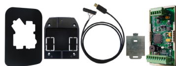
Decorative plate / Spacer / Converter cables / Mounting plate...