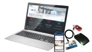
SECARD SECard configuration kit and SSCP® v1 & v2 and OSDP™ v1 & v2 protocols

**Caution: information about the distance of communication: measured from the center of the antenna, depending on the type of credential, size of the credential, operating environment of the reader, temperatures, power supply voltage and reading functions (secure reading). External interference may reduce reading distances. Legal: STid, Architect® and SSCP® are registered trademarks of STid SAS. All trademarks mentioned in this document belong to their respective owners. All rights reserved – This document is the property of STid. STid reserves the right to make changes to this document and to cease marketing its products and services at any time and without notice. Photos are not contractually binding.