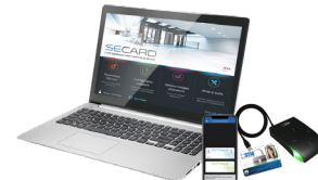
SECARD SECard configuration kit and SSCP & SSCP2 protocols